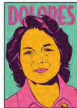
DOLORES HUERTA FOUNDATION